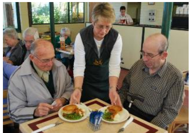
Orana Luncheon at Pie in the Sky earlier this year