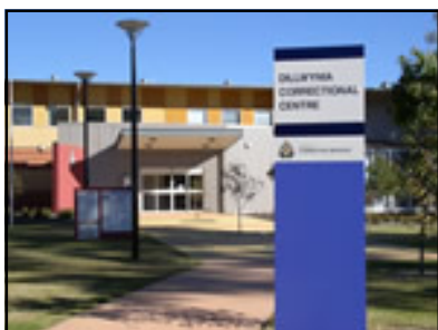
Dillwynia Women’s Correctional Centre, South Windsor