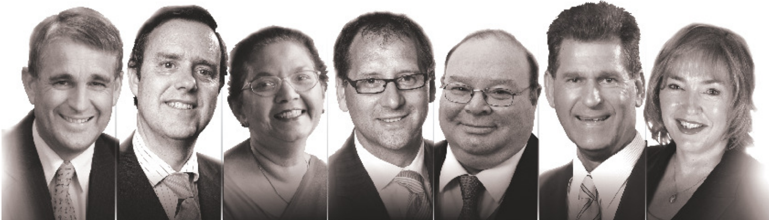
JOHN ANDERSON FORMER DEPUTY PRIME MINISTER